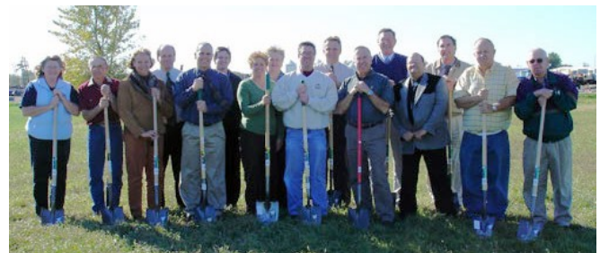
Groundbreaking at the ALCO site